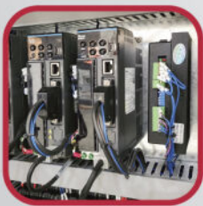
AC Delta Drivers