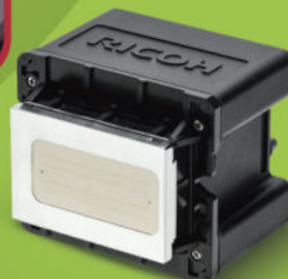
Ricoh G5i printhead.

Personalize cylindrical objects with KOI 360° Printer